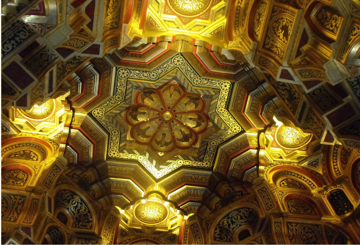
Cardiff Castle ceiling

Join us on this memorable trip as we enjoy and learn of the significant and exciting regeneration of Cardiff, steeped in some unique heritage and history.